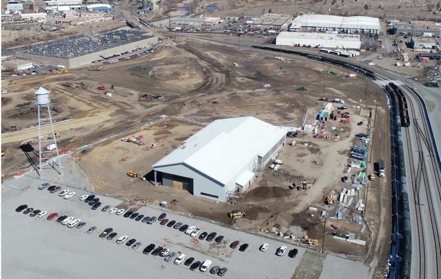
Construction continues at the Stockyards Event Center with the recent installation of storefront glass. Grading has begun on the west plaza in addition to the east side of building (bison area).